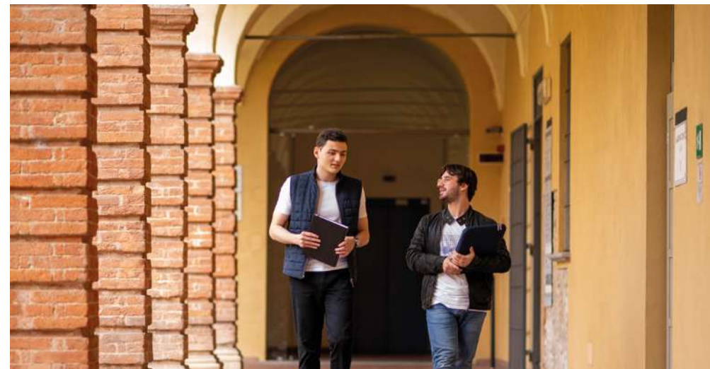
Campus Caserma Neve

The Politecnico is a point of excellence among Italian and international universities, synonymous around the world with quality and innovation, even in its relationships with social organisations and local companies. This result has been fed by the progressive spread of the university across the area, expanding since the 1980s from the centre of Milan and establishing campuses in different cities of Northern Italy.